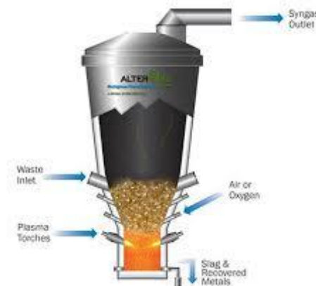
Picture indicating parts of a gasifier.

Waste to energy is the procedure through which non-recyclable waste products are converted into energy such as useable heat, electricity or fuel. This change can happen through a variety of technological methods. Although it is not cost-effective, the Waste to energy method offers a wide variety of advantages. Specifically, since this method converts waste into energy such as fuel, it can be used as an alternative for fossil fuels, thus eliminating their need and in turn, by limiting their need and use, diminishing carbon emissions. Moreover, it brings an alternative, cheap method to bringing electricity to communities and community buildings. If LEDCs were to apply this form of waste management they would both handle their waste management problem as well as provide electricity for the people of their communities and cities.