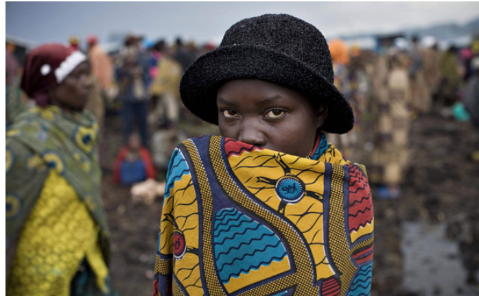
Figure 2. Child Refugees of Congo

in those areas, as Motassem, a 16-year-old student in Syria, confesses: “I am in ninth grade but this war stopped me from graduating – I should have graduated and gone to high school, to start building my future but no... my future is destroyed”.