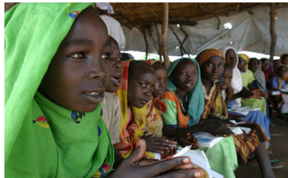
Figure 4. Dozens of children in one classroom – Inadequate Education Funding

children were killed and 343 more were injured. Moreover, a lot of families with children may immigrate and be displaced in refugee camps where access to education is highly limited. Another reason might be the fact that during conflicts a lot of families are separated and their children are recruited by armed forces and consequently made to work instead of attending school. Additionally, diseases and contagious illnesses such as ebola, malaria or diarrhea, which can be easily observed in conflict-affected countries due to the poor sanitation and medical healthcare, may contribute to the prohibition of education, as schools may close to hinder the further spread of such viruses and bacteria. Finally, teachers are highly likely to be killed or abducted and due to the lack of working personnel, schools are closed preventing children from acquiring valuable education. Yet, as Nelson Mandela once claimed