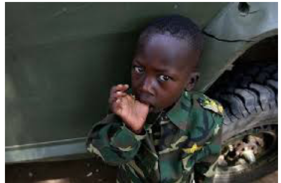
Figure 11. Young child-soldier

The serious problems children are facing in war-torn areas can affect the whole world in the long term. Therefore, the international community had to make some steps towards finding a solution to this tragic situation innocent people, and especially children, were facing. To begin with, in 1948 the Universal Declaration of Human Rights was signed by the members of the United Nations, a declaration which among others recognizes the right of every human being to education. Moreover, some years later, on the 20 th of September 1989 another big step was made by the United Nations, namely the creation of the United Nations Convention on the Rights of a Child. This convention had as a main goal to clarify each and every right of the children, focusing on banning the recruitment of children and on the right to education. Furthermore, lots of Non-Governmental Organizations are annoyed by the fact that this phenomenon still exists and do the best they can in order to solve it. Last but not least, several resolutions concerning the rights of the children have passed both in the United Nations Security Council and the General Assembly. For example the Security Council Resolution 1539, which recognizes the Sixth Grave Violations and the General Assembly Resolution 64/146 that refers generally to the rights of the children.