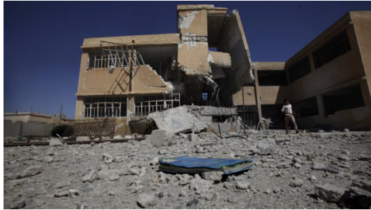
Figure 3. A Damged school in a conflict-affected region

of the principal reasons is that schools in conflict-affected states are damaged, burnt down, destroyed, attacked or even bombarded and thus considered improper to house students. For instance, according to The New York Times and the United Nations Children's Fund (UNICEF), 68 attacks on schools were reported only in one year during the Syrian civil war and the casualties were dreadful as 160