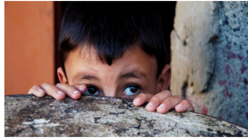
Figure 5. A frightened child during a conflict.

It is estimated that in the last decade there were 2 million children in conflict areas who have been killed and another 6 million who have suffered from serious injuries and other medical problems. Furthermore, there were almost 10 million children who have been afflicted with psychological traumas and long-term psychological repercussions and about 1 million children who have lost their parents in conflict. These figures can be correlated with the recruitment of children by armed forces and military-terrorist organizations, since children are forced to take part in conflicts and fight alongside adult soldiers and