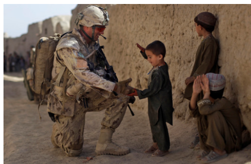
Figure 9. Afghan child greeting soldier

The Security Council adopted the United Nations Security Council Resolution 1539 in 2004. The first and the second paragraph of the resolution recognize six categories of violations which are named “The Six Grave Violations”. They include the “killing or maiming of children”, the “recruitment or use of child soldiers”, “rape and other forms of sexual violence against children”, the abduction of children”, “the attacks against schools and hospitals”, and the “denial of humanitarian access to children”. These violations are considered to be illegal crimes. This resolution aims at the protection of children, especially in conflict areas, as most children in such areas suffer from almost all these categories and experience grave brutalities.