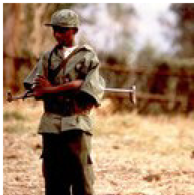
Figure 6. A Child Soldier

thus experience violent activities which can impinge on their future. Except fighting in combat, children are used to accomplish other similarly difficult tasks which involve serious risks and can lead to humiliation. These may include spying, serving as messengers and porters carrying heavy loads, such as injured or dead soldiers. Moreover, girls are used as sexual slaves and are consequently being raped witnessing immoral sexual acts. The United Nations Security Council acknowledging all these events has recognized “The Six Grave Violations” which include inter alia “killing and maiming children”, the “recruitment or use of children as soldiers”, “sexual violence against children” and the “abduction of children”. All these actions are considered to be illegal and therefore are stipulated as crimes by the International Court of Justice (ICJ).