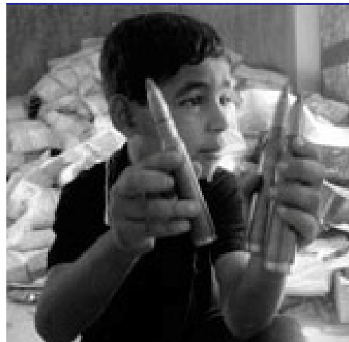
Figure 1. A Child Soldier holding missiles.