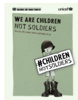
Figure 10. Children

The Campaign “Children, Not Soldiers” was launched in March 2014 by UNICEF and the Special Representative for Children and Armed Conflict. Its main aim was to stop the recruitment of children in conflict areas by 2016. Since 2014, a lot of progress has been made, especially in South Sudan, Sudan, Afghanistan and the Democratic