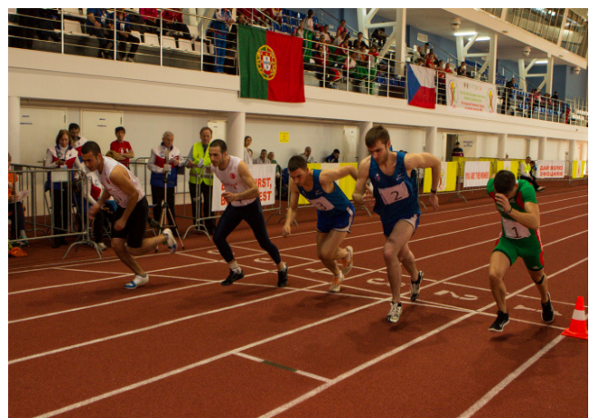
Figure 1.1: Athletes with intellectual disabilities

Its vision and actions focus on the belief that an intellectual disability shouldn't prevent the individual from excelling in sports. Furthermore, it believes that intellectually disabled athletes around the world should have the opportunity to