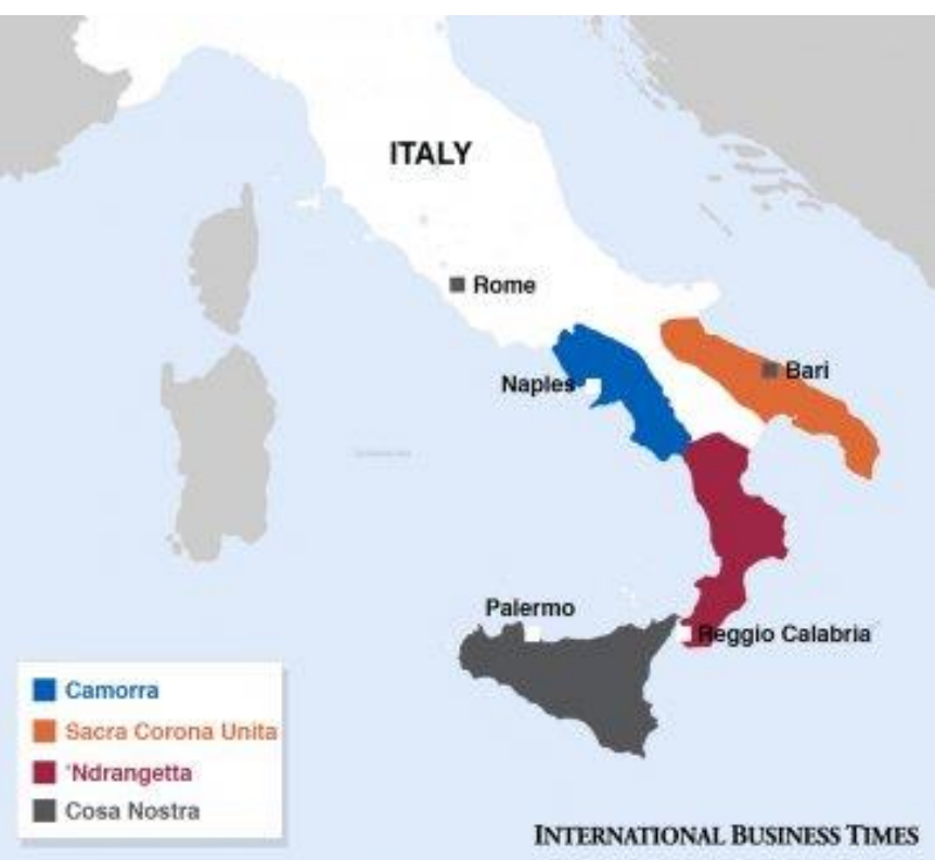
Figure 4: "Italian Mafia groups"

The Mafia is a network of organised crime groups based in Italy, especially in Sicily (an island ruled until the 19<sup>th</sup> century by a long line of foreign invaders and of Sicilian brigands in the 19<sup>th</sup> and 20<sup>th</sup> century) and in America. The origin of Italian Mafia criminal organisations is the subject of abundant literature and there are also some fundamental and interconnected doctrines that must be taken into consideration whenever the Italian Mafia is involved. This include the tenets of family, power, respect and territory. The Italian criminal societies (also known as the Mafia), since their appearance in the 1800s, have influenced and damaged the economic fabric not