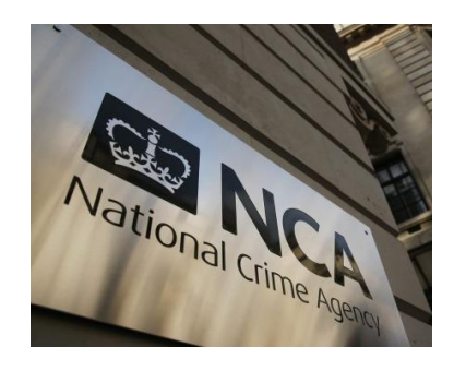
Figure 5: "National Crime Agency officials""

The National Crime Agency, also known as the NCA, is a crime-fighting law enforcement agency responsible for leading the UK's fight to cut serious and organised crime. However, it functions both in national and international level and tries to combat illegal activities such as human trafficking, child sexual exploitation, drugs, firearms and cyber-crime. As mentioned before it is the body that replaced SOCA and so it is active since 7<sup>th</sup> October 2013.