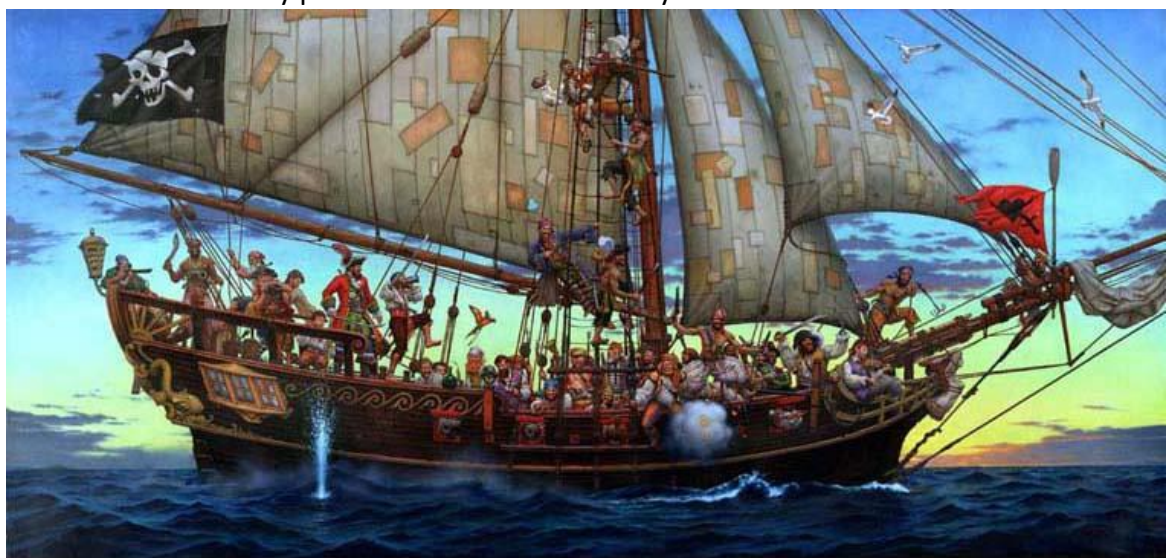
Figure 2: "Forty thieves Gang"

Organised Crime as we recognise it today can be first found in the early 1800's with the first organised crime group the Forty Thieves Gang in New York which was the first gang that flourished from 1820 to 1860. Its members were immigrants who came close in order to be protected and to have financial gain. The feeling of protection among the members originated from the blind trust each person had and the ambition that their lives could follow a different path of fate. The Forty Thieves, were Irish or Americans, people that lived under harsh conditions with a very poor economic sustainability.