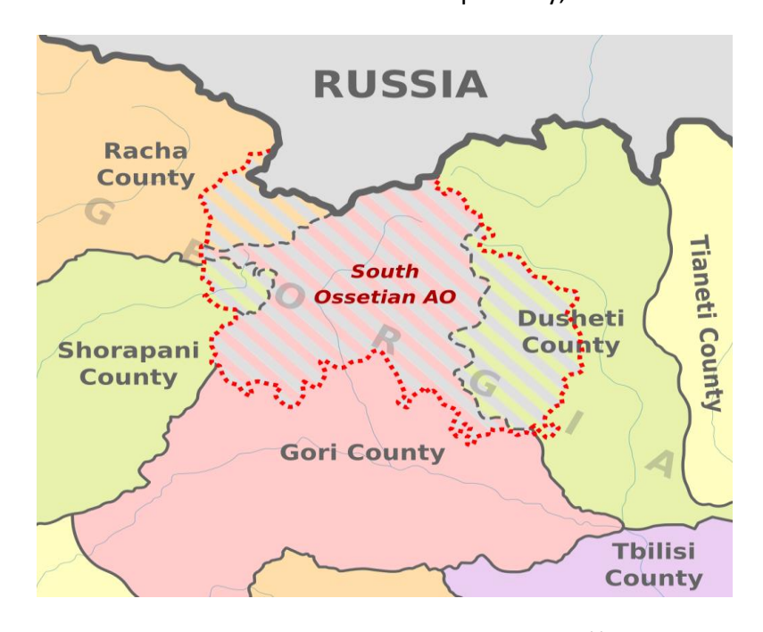
Figure 2 Map of South Ossetian Autonomous Oblast <sup>11</sup>

being the official language for transactions and instruction.<sup>10</sup> The region also saw infrastructure development, with railroads and construction within its capital city, Tskhinvali.