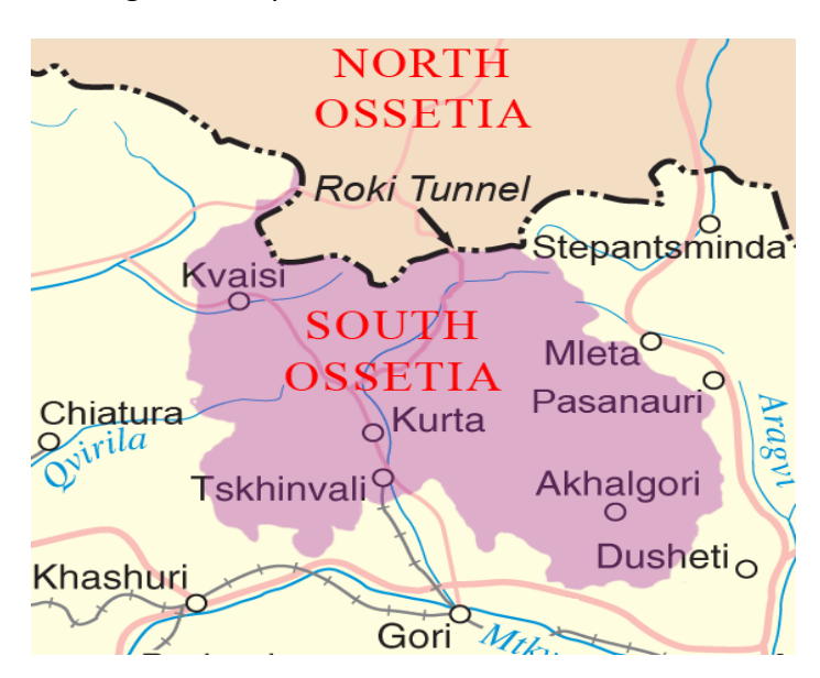
Figure 1 Map of south ossetian territory<sup>6</sup>

South Ossetia is a landlocked region located in the Southern Caucasus, bordering Russia and Georgia. As of the 2023 census, it has an approximate population of 56,520 people with nearly half of the residents living in the capital Tskhinvali.